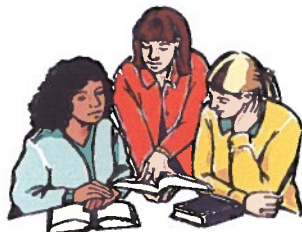
Women's Bible Study