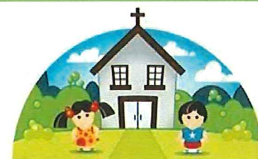
MY FRIEND'S HOUSE CHILD DEVELOPMENT CENTER