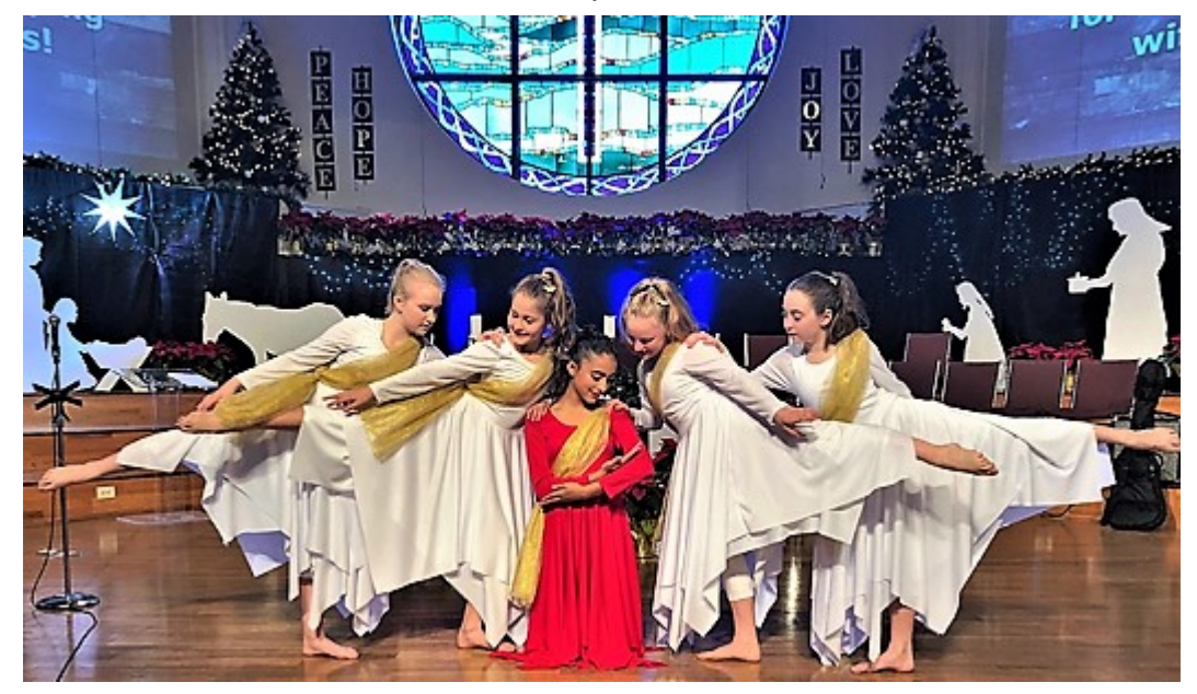
Beautiful Living Natvity