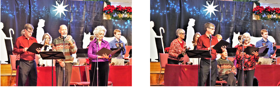
Special Performance by Adoration Dance